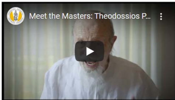
[September 30, 2021] by Professor Theodosios Tassios